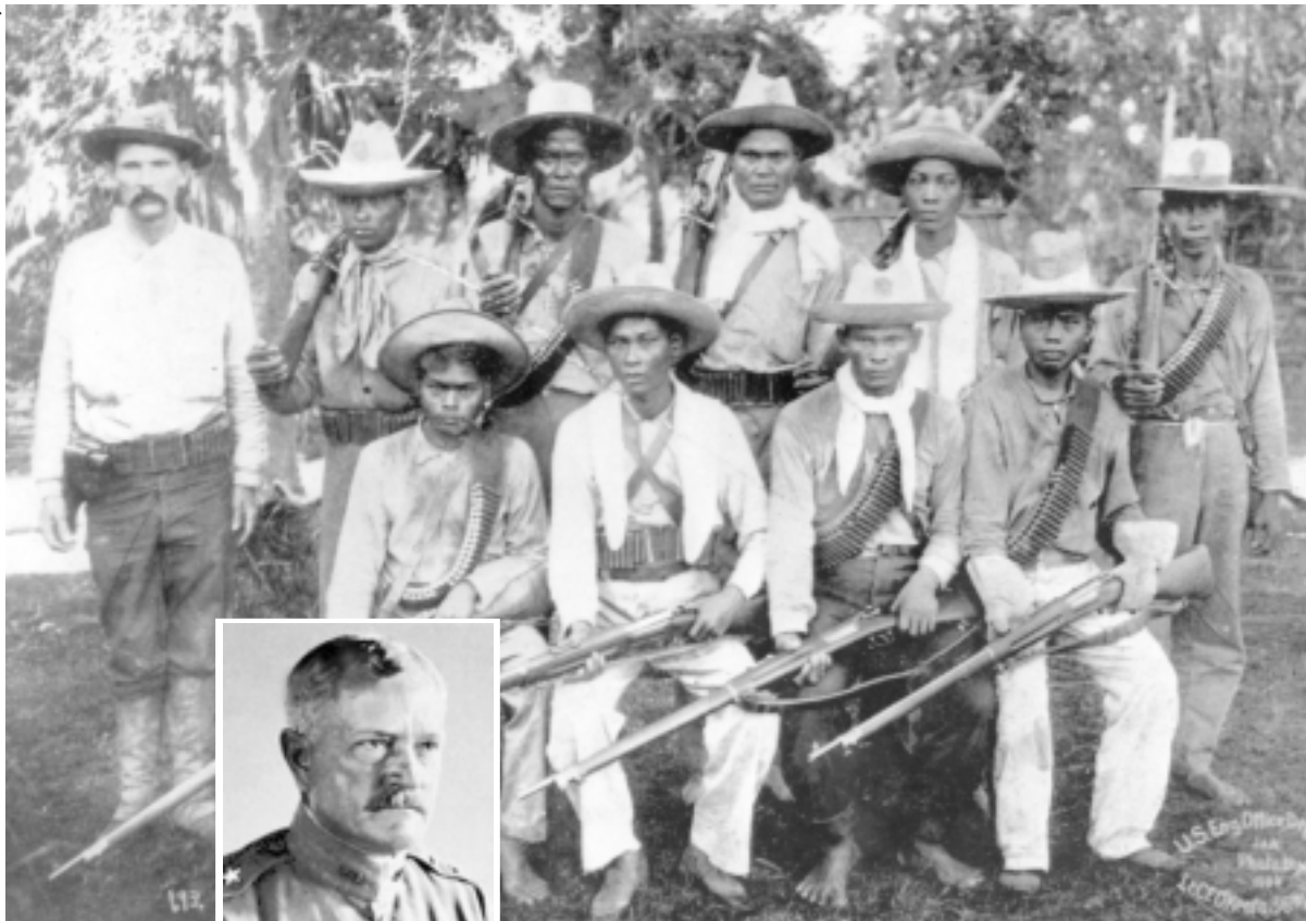
Filipino scouts and their officer during the Philippine Insurrection. (Inset) Brigadier General John J. Pershing.