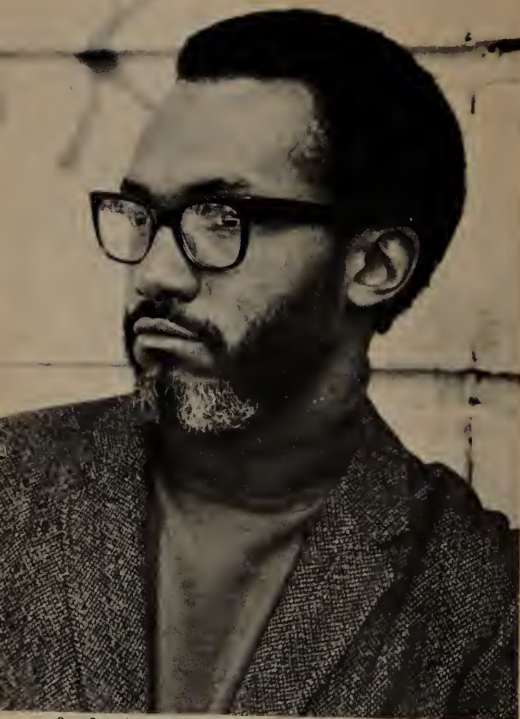
Sam Greenlee, author of The Spook Who Sat By The Door