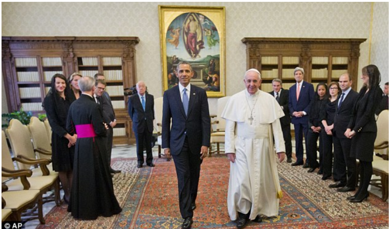
Obama at the Vatican with the ‘real’ president Pope Francis

The constitution for the District of Columbia operates under tyrannical Vatican law known as “Lex Fori” (local law). When congress passed the act of 1871 it created a separate corporation known as THE UNITED STATES and corporate government for the District of Columbia. This treasonous act has unlawfully allowed the District of Columbia to operate as a corporation outside the original constitution of the United States and in total disregard of the best interests of the American citizens.