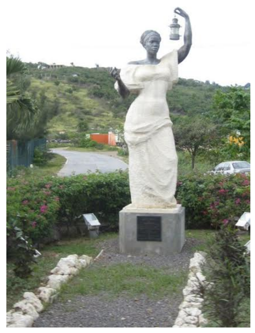
First American Statue of Liberty ( created by France as a gift to the US which was rejected and a new white Statue of Liberty was created.)